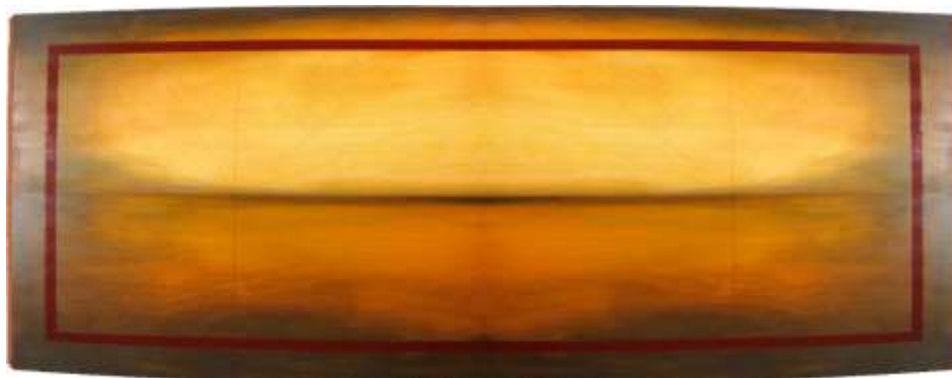
1999 Jon Tarry Liminal Spaces, 1999 Plywood, gesso and acrylic. 90 x 235 x 30 cm