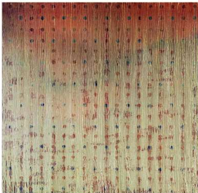
1998 Trevor Richards Field Map 1, 1998 Oil, acrylic, sand on board. 156 x 162 cm