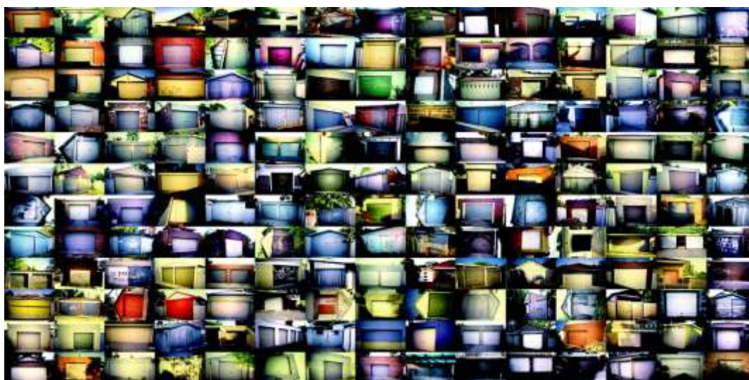
2001 Rodney Glick and Lynette Voevodin Garages and Numbers, 2001 Digital print on vinyl and MDF. 150 x 300 cm