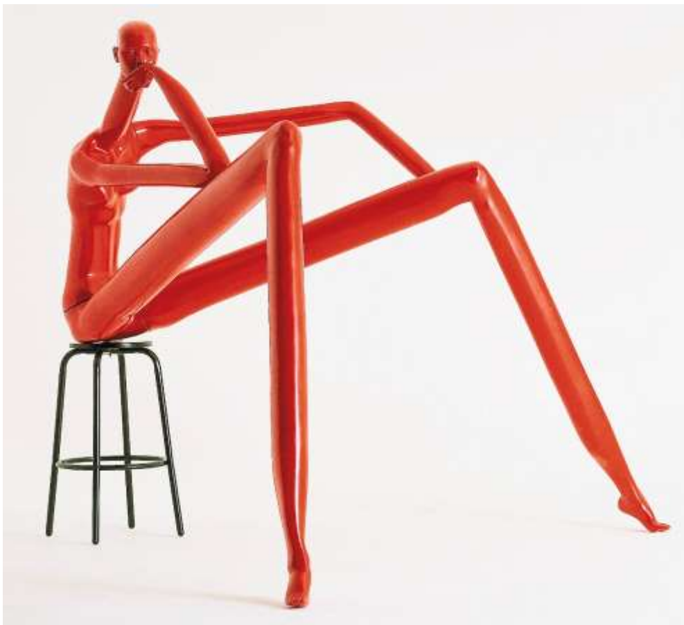
2000 Richie Kuhnaupt Woman in Red, 2000 Resin, steel, polyurethane, enamel paint. 200 x 200 x 200 cm