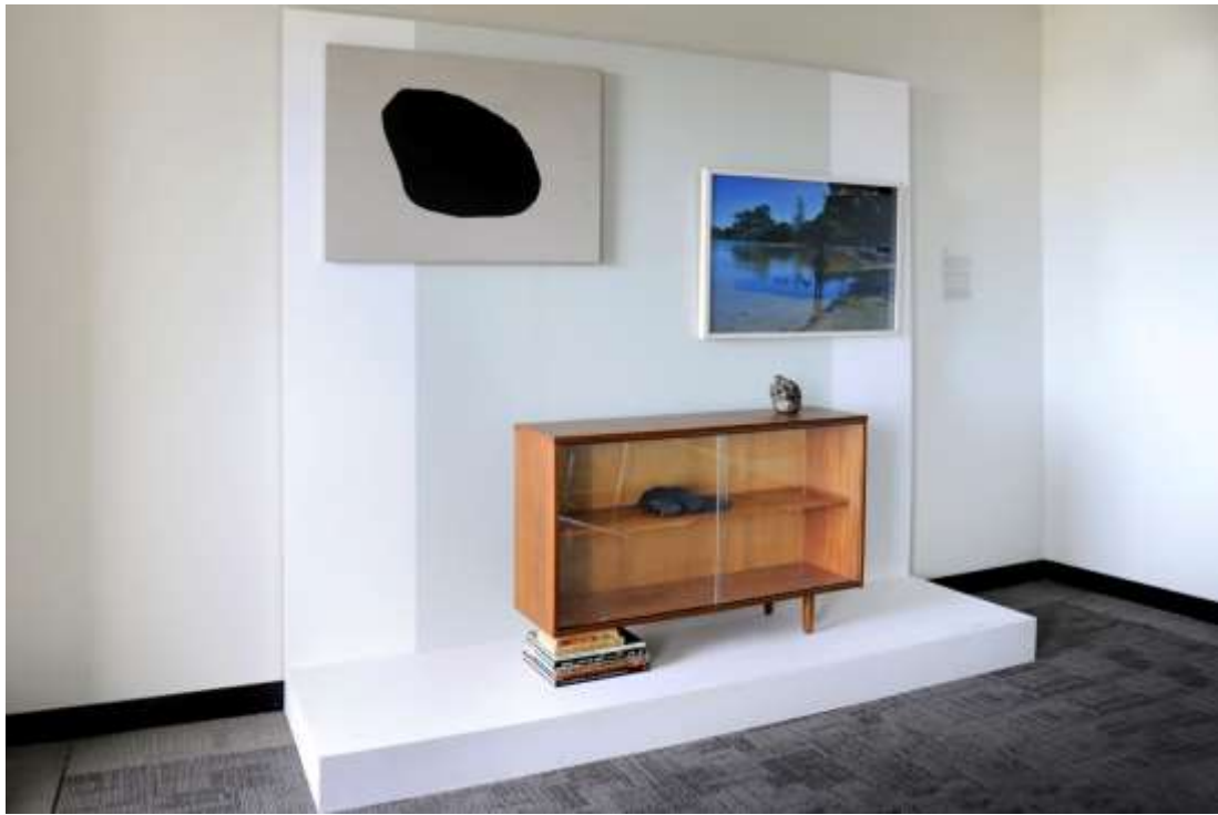
2012 Kate McMillan Internal Histories, 2012 Installation. Dimensions variable.